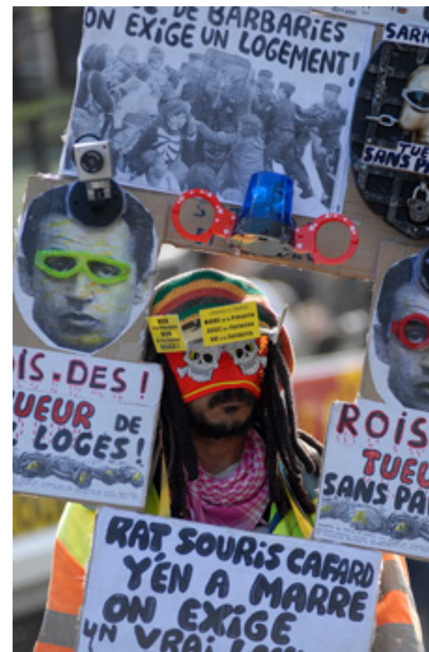
Manifestation des sans-papiers du 30-09-06

Before looking at the ways in which the French government has sought to extend these policies to the EU, it is important briefly to consider earlier EU initiatives. According to the 'Freedom, Security and Justice' page on the EU's 'Justice and Home Affairs' website, in October 1999, EU leaders at a European Council meeting in Tampere, Finland: "called for a common immigration policy which would include more dynamic policies to ensure the integration of third-country nationals residing in the European