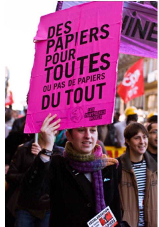
Des Papiers Pour TouTEs

EU laws designed to punish abusive employers exist, notably Article 5 of the Charter of Fundamental Rights that concerns the Prohibition of slavery and forced labour: (i) No one shall be held in slavery or servitude; (ii) No one shall be required to perform forced or compulsory labour; (iii) Trafficking in human beings is prohibited. The European Court of Human Rights in Strasbourg is also committed to protecting human beings from slavery, servitude and forced or compulsory labour. Nevertheless, abusive practices have been widely tolerated, and extensively documented. As Hugo Brady reports in a briefing