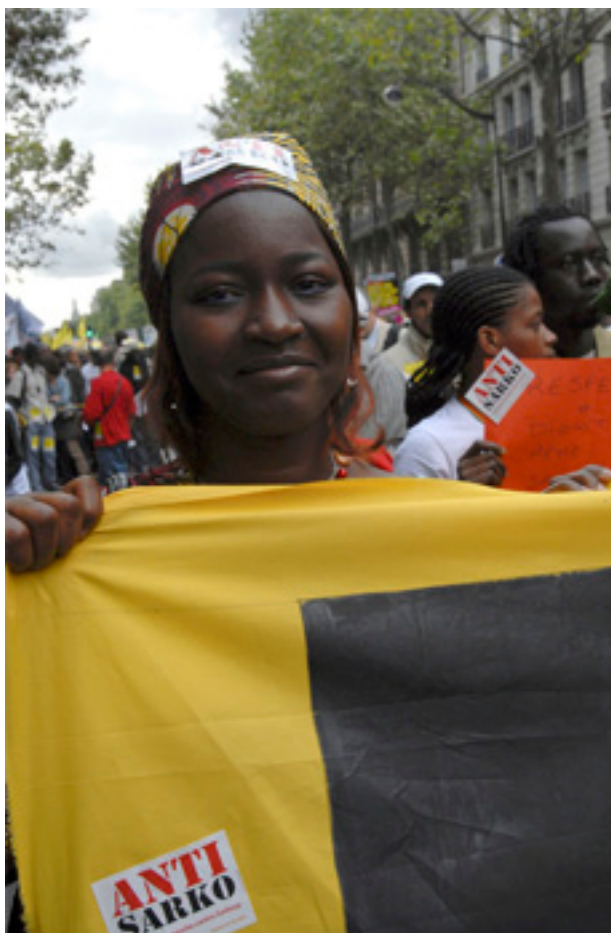
Anti Sarko Manifestation des sans-papiers du 30-09-06