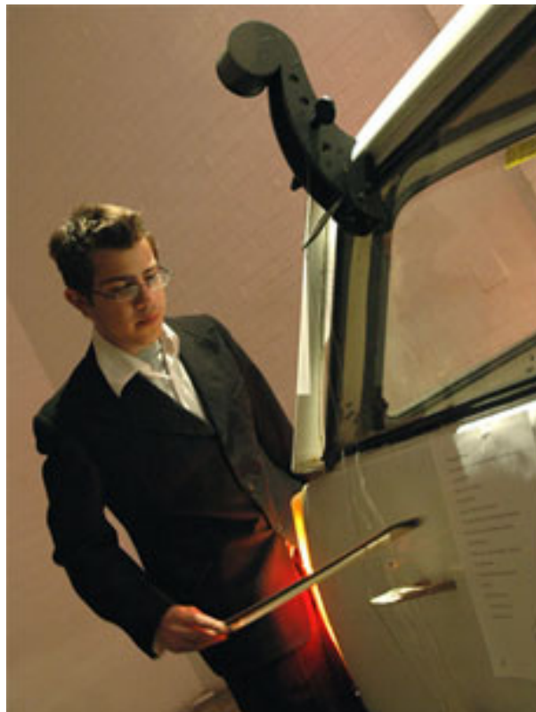
The Collision Project being performed in The Substation, Wits University, 2006.

But I can't help but wonder what led them to take